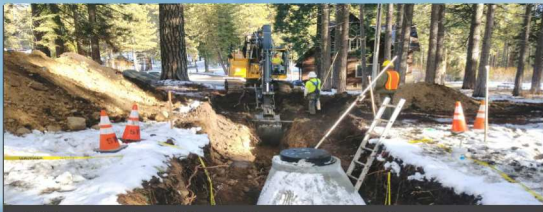
NPS ~ Replace Water Distribution & Sewer System