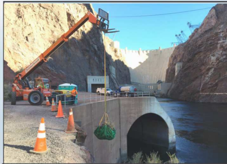
BOR - Hoover Dam / Timber Bridge Removal & Replacement