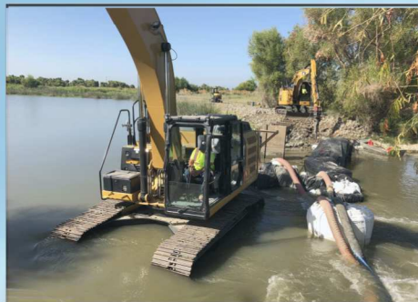
BOR - Eastside Bypass Improvements