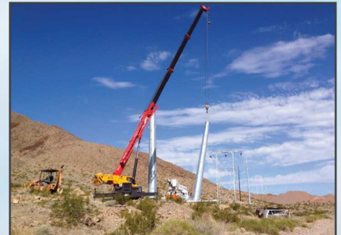
DOE - Boulder City Bypass