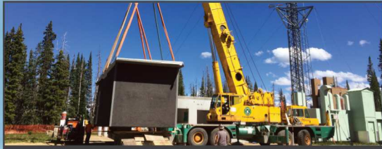
DOE ~ Buffalo Pass Communications Building

A Native American owned General Engineering / Building Construction firm specializing in contracts between a variety of public agencies. We have been providing comprehensive General Engineering and Building Construction with 5-Star results for 16+ years. Our commitment to customer service and developing long-term relationships has earned us an exceptional reputation. Whether your agency is local or global in reach, we have the resources, experience and relationships in the marketplace to provide you with the strength and stability necessary in today's business market. We pride ourselves on our safety procedures while providing quality services while simultaneously completing our projects on time and within budget.