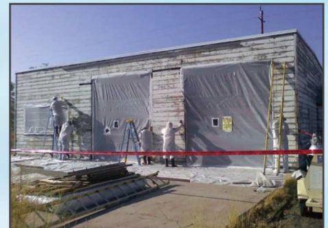
NPS - Lava Beds Historical Renovation