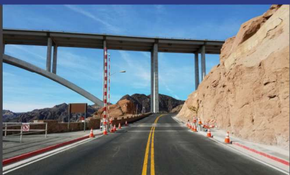
BOR ~ K12 Barriers, Hoover Dam