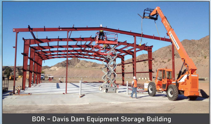
BOR ~ Davis Dam Equipment Storage Building

Please check our website for current information www.swsgc.com