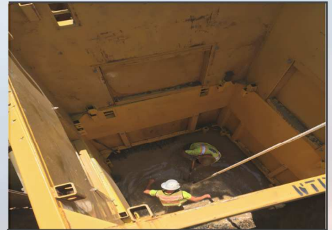
COR - Bechelli Lane Water & Sewer