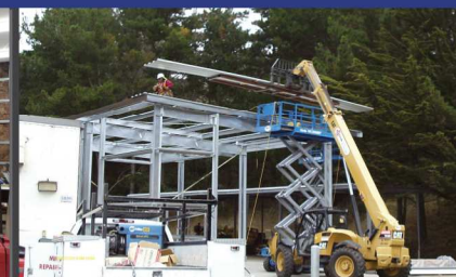
DOI ~ Vehicle Wash Rack