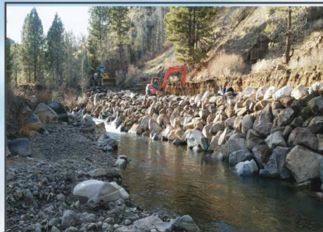
USDOT - Bizz Johnson Trail Erosion Repairs