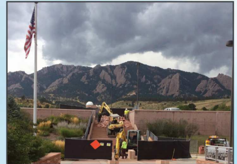
GSA Concrete Stairs