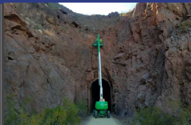
NPS ~ Maintain Historic Railroad Tunnels